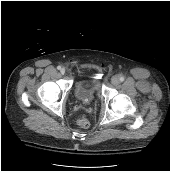
Figure 2: CTV of the pelvis.