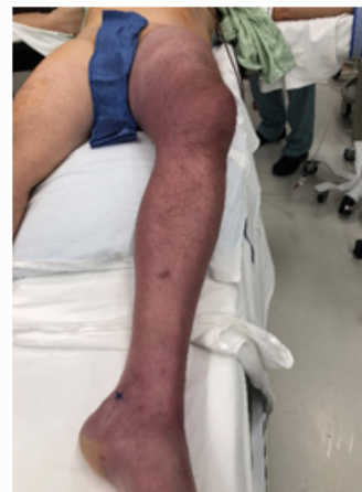
Figure 1: Discoloration of left lower extremity.

complained of left lower extremity swelling and paresthesias without pain. Patient was sent to the intensive care unit for close monitoring. While there, he developed bluish-purple discoloration of his entire left lower extremity associated with pain (Figure 1). On exam, the patient had bluish-purple discoloration and swelling of the left lower extremity extending from the foot to the thigh was noted. He had limited movement in the toes but no sensation to light touch on the dorsum of the left foot. Left lower extremity was warm to touch. Patient had a weak left dorsalis pedis and a weak posterior tibial pulse. A Computed Tomography Venogram (CTV) of the abdomen and pelvis was performed (Figure 2).