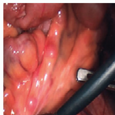
Figure 1: Image of normal appearing appendix.

The patient's mother told that "Initially I assumed that the pinworm infection was caused by uncleanness or due to poor hygiene, so I started to sanitizemy son's and my hands more frequently. After having a discussion with the doctor at a follow up session, I was explained how the infection can spread from school or play areas and not necessarily due to my fault. After this was communicated to me, I felt reassured and my sense of guilty had been eased, it was a very important message to me".